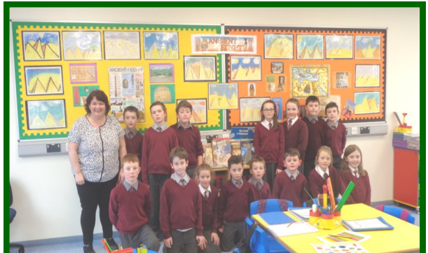
A delighted Primary Five with Mrs. Mc in their stunning bright and spacious classroom!

Pictured are pupils enjoying our new outdoor space and extended playground at dinnertime! Primary 5 and 7 are delighted to have moved into their new classrooms. Work will continue to progress over the coming weeks and we appreciate your continued patience with this. Many thanks.