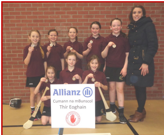
Pictured is the Girls' Camogie Team who competed in the Tyrone County Indoor Camogie Final last Friday in the Station Centre. Well done girls on your skilful and competitive performance!