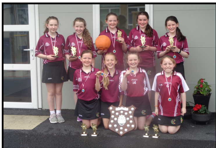
The Girls' team pictured with the shield.

Primary 7 girls who recently came first in a highly competitive local Netball Competition in Omagh Leisure Centre. Congratulations girls on bringing home the shield for the second successive year in a row!