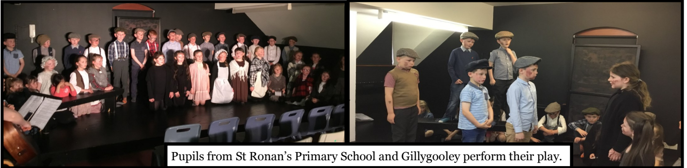
Pupils from St Ronan's Primary School and Gillygooley perform their play.